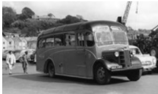
The Marigold Bus waiting to take passages to Porthtowan. The owner lived in Hush House now The Mance.